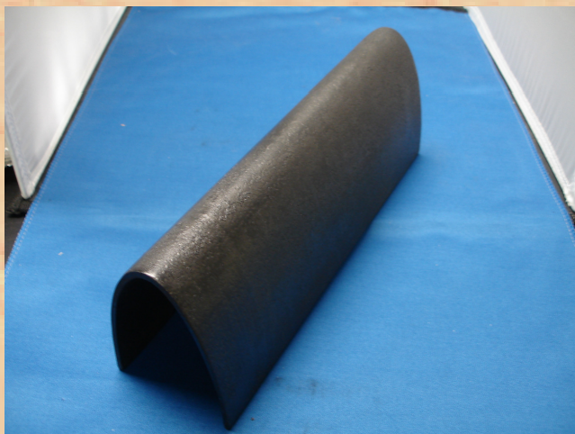
Hypersonic Leading Edge Demonstrator C(f)/ZrOC(m)