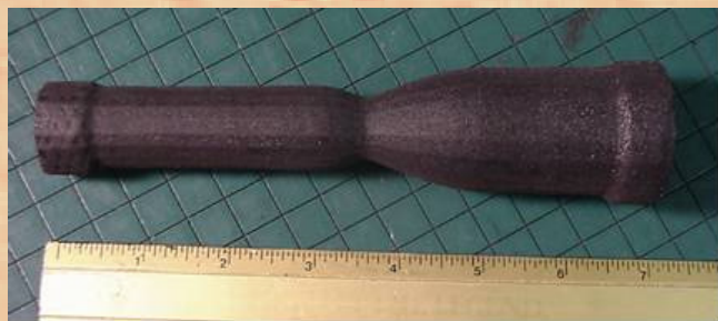
Divert Thruster Braided C(f)/HfC(m)