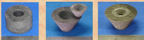
Pintle Guides, Throats, and Throat Insulators C(f)/ZrOC(m)

MATECH 31304 Via Colinas, Suite 102 Westlake Village, CA 91362 phone: 818.991.8500 f: 818.991.4134 e-mail: ed@matechgs.com